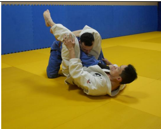
Sankaku-jime / Triangle hold or strangle (from bottom position)

Hug from behind (under arms) solution 2: Trap uke's arm on one side, hook outside that side's leg, hop around for O-soto-otoshi to throw backward