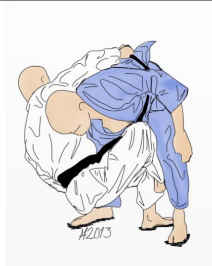
Hikikomi-gaeshi / [belt] pulling throw Sumi-gaeshi / Corner throw (sacrifice)