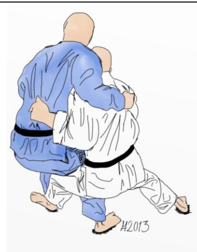
Tani-Otoshi / Back drop