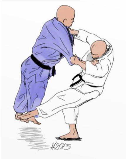
Okuri-ashi-barai / Side-sending foot sweep