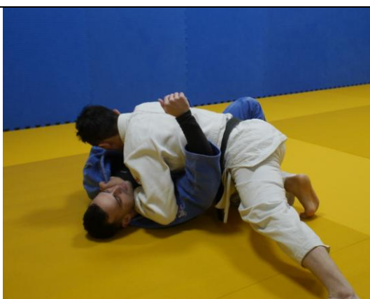
Katate-jime / Side hand strangle