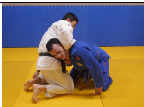
Hadaka-jime (Mae or omate) / Naked strangle (front)