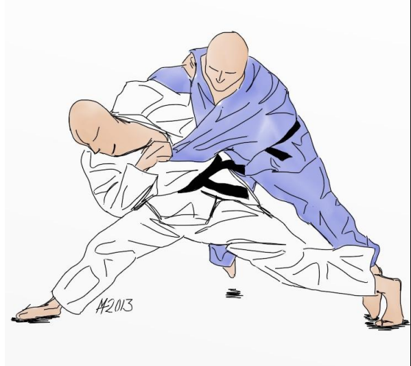
Tai-otoshi / Body drop