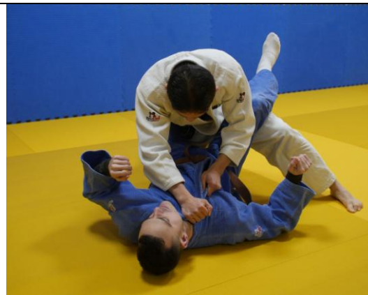
Tsukkomi-jime / Thrusting strangle