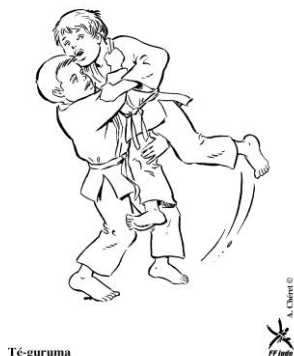
Sukai-nage (also te-guruma / hand wheel)