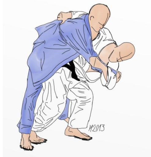
Tsuri-goshi / Lifting hip throw

Ren-zoku-waza: Tsuri-goshi to tsuri-goshi