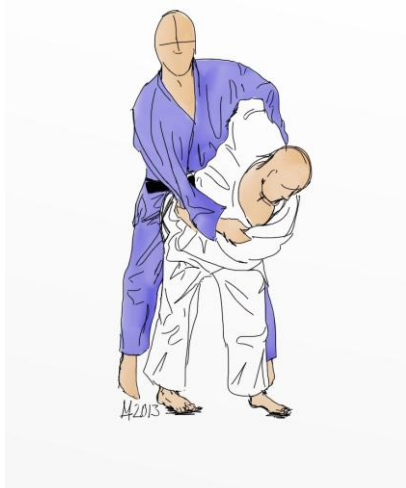
Uki-goshi / Floating hip

Standing Techniques / Tachi-waza: must perform uchi-komi and nage-komi