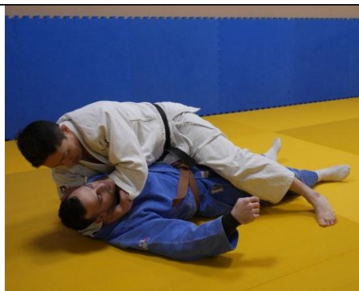
Sode-guruma-jime / Sleeve wheel strangle