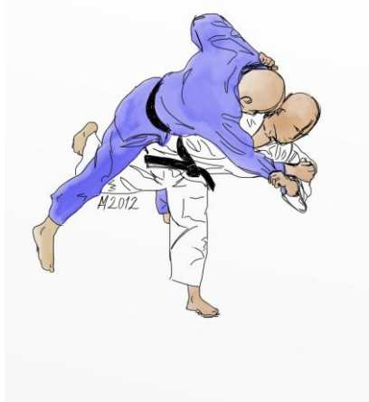
Uchi-mata / Inner thigh throw