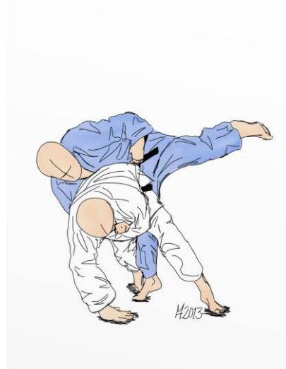
Soto-makikomi – outside winding throw