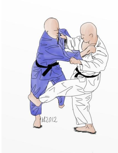
Hiza-guruma / Knee wheel