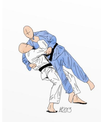
Ura-nage / Lifting backward throw