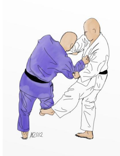
De-ashi-barai / Advancing foot sweep and counter-technique: Tsubame-gashi / Swallow Counter