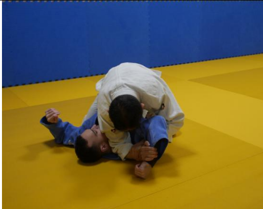
Ude-garami / Entangled arm lock