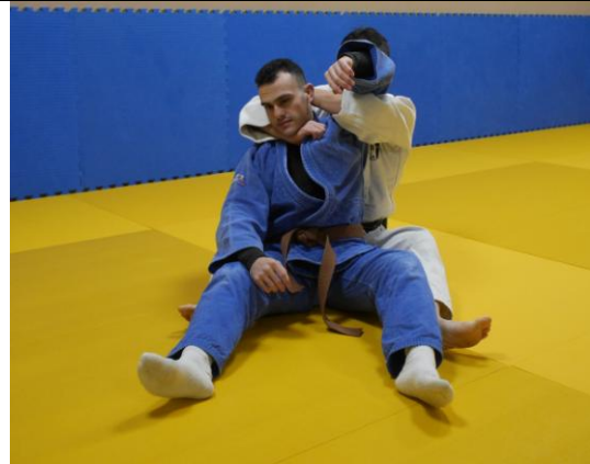
Kataha-jime / Single wing strangle