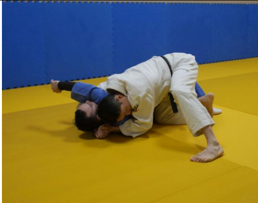
Kata-gatame / Shoulder hold