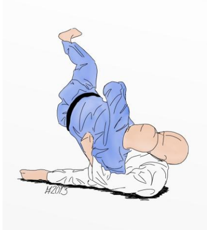
Yoko-guruma / side wheel