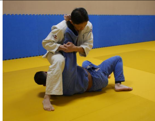
Ude-hishigi-ude-gatame ("ude-gatame") / [straight] arm lock