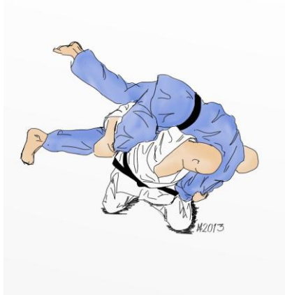
Kata-guruma (shoulder wheel), one-knee and two-knee down version