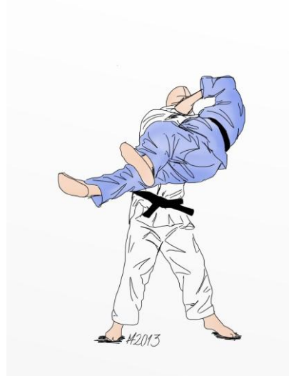
Ushiro-goshi / rear hip throw